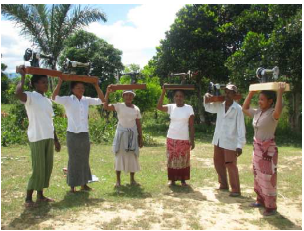
Some of the sewing cooperative's manual sewing machines, including the two purchased with donor funds for use in the sewing & tailoring workshop.

The Ambodigavo grandmothers, mothers and daughters who participated in the tailoring seminar proudly wore one of their newly-sewn outfits at a closing ceremony in the village on November 20<sup>th</sup>, attended by the Mayor, village elders, Antanetiambo Nature Reserve staff, and a local journalist. It looks like our project may make a Malagasy national news story!